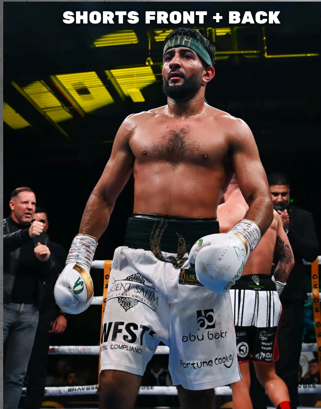
SHORTS FRONT + BACK