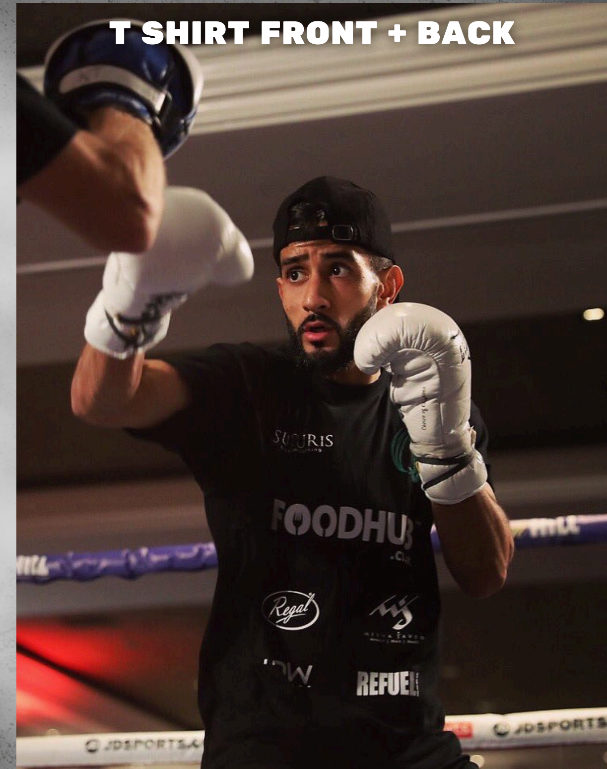
T SHIRT FRONT + BACK

YOUR LOGO WILL APPEAR ON OFFICIAL TEAM T-SHIRTS WORN BY THE ENTIRE TEAM LEADING UP TO THE MAIN EVENT (MINIMUM ONE WEEK)